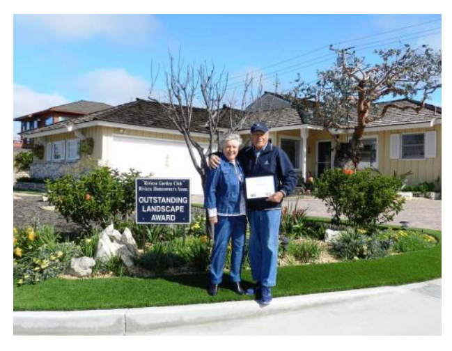
Feb. 2017—99 Calle Mayor The Guaglione Residence

Hollywoodriviera.org/Riviera-landscapes/